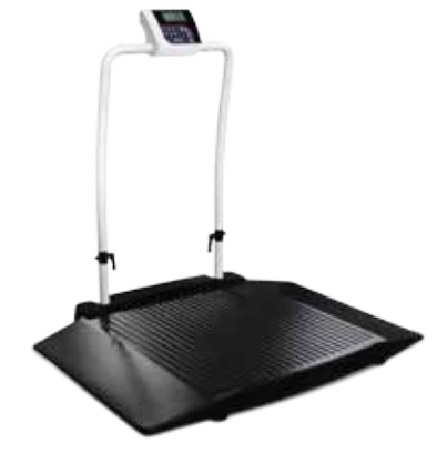
Dual Ramp Wheelchair Model 350-10-3