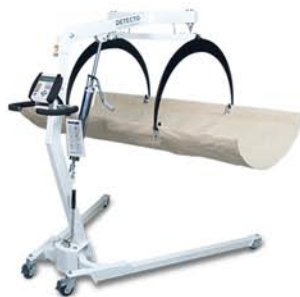
IB800 In-Bed Scale