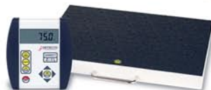
GP400-750 Platform Scale