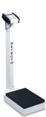
6127 Waist-High Scale