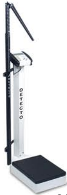
6129 Waist-High Scale With Height Rod