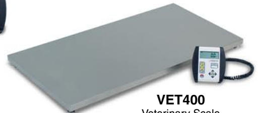
VET400 Veterinary Scale