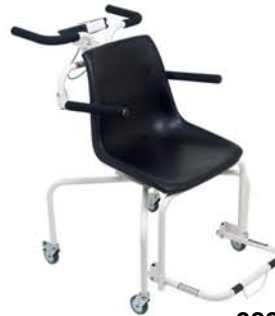
6880 Chair Scale