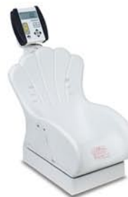
8432CH Pediatric Scale