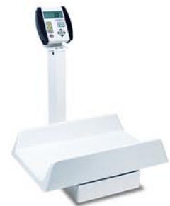
8435 Pediatric Scale