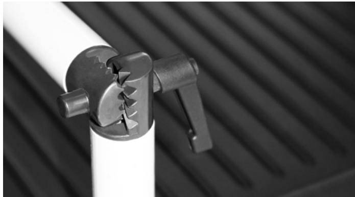
Figure 3-1. Secure the Handrail by Tightening the Durable Hinges