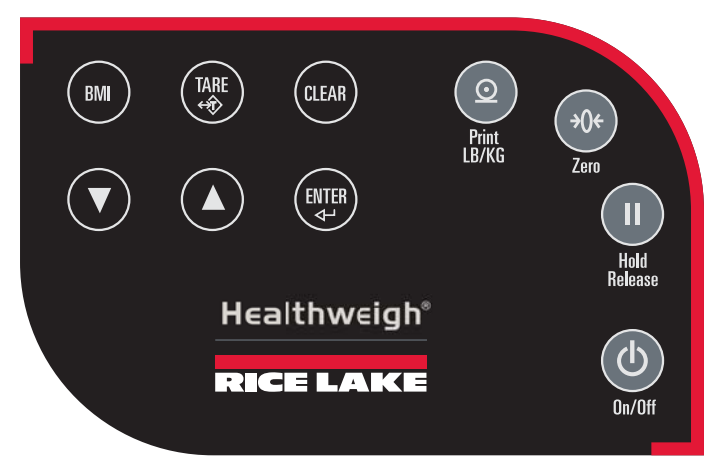
Figure 4-1. Front Panel Display Keys

The Rice Lake Digital Bariatric Handrail Scale with seat display has various front panel keys as shown in Figure 4-1.