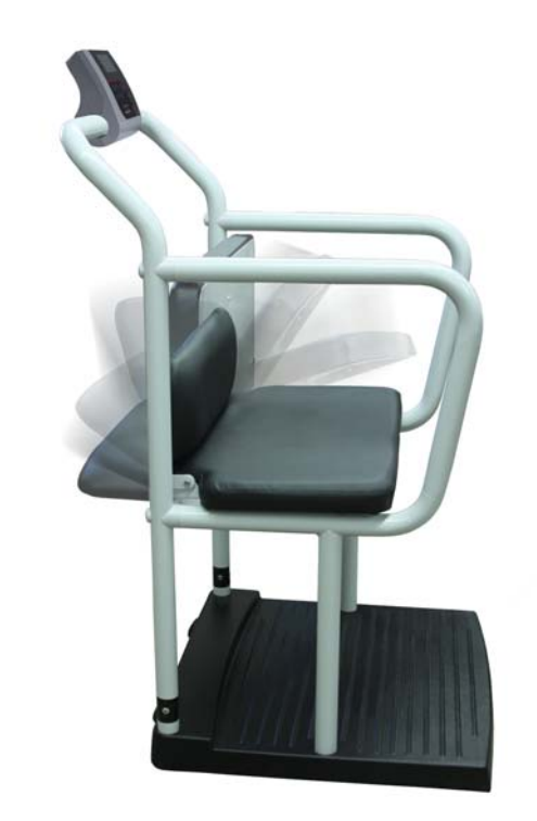
Figure 3-2. Unfolding the Seat

The Digital Bariatric Handrail Scale comes with a fold down seat for those patients who need to be weighed while seated. To unfold the seat, simply pull down on the seat bottom as shown in Figure 3-2.