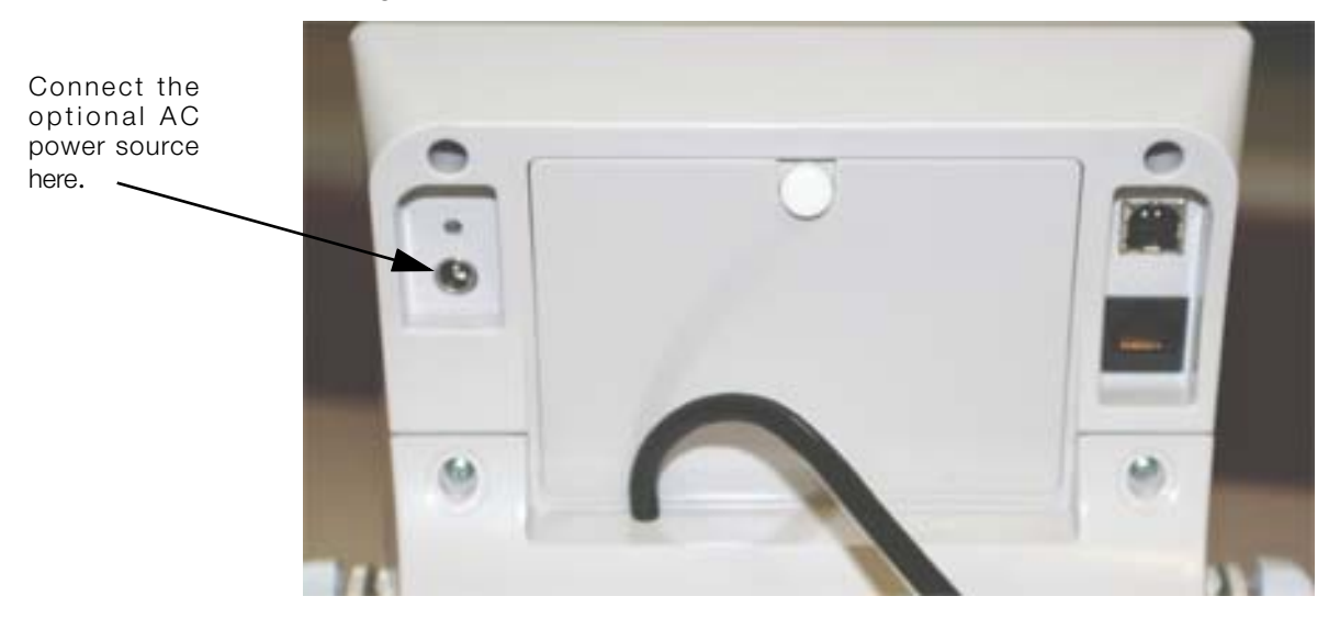
Figure 3-4. Power Connection

Use the optional 120 VAC or 230 VAC adaptor when power is available. The AC power adaptor plugs into the back of the indicator as shown in Figure 3-4.