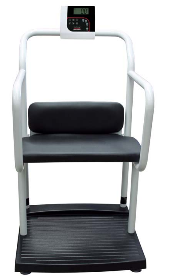
Figure 1-1. Digital Bariatric Handrail Scale with Fold Down Chair (250-10-4)

This manual can be viewed and downloaded from the Rice Lake Weighing Systems web site at www.ricelake.com/health. Technical information on this product and other medical products are available on the Rice Lake Weighing Systems web site. Rice Lake Weighing Systems is an ISO 9001 registered company.