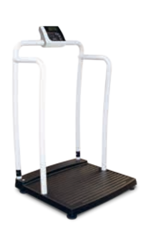
Bariatric Model 250-10-2