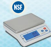
PORTION CONTROL SCALES