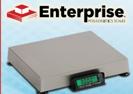
RETAIL POINT-OF-SALE + BATCHING SCALES