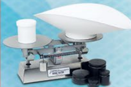
BAKER DOUGH SCALES