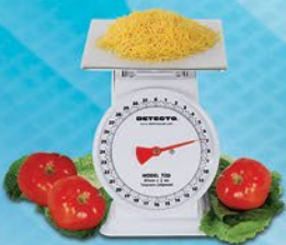
TOP LOADING DIAL SCALES