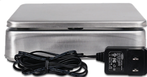
Comes with UL/CSA-listed wall plug-in power supply and internal rechargeable battery pack