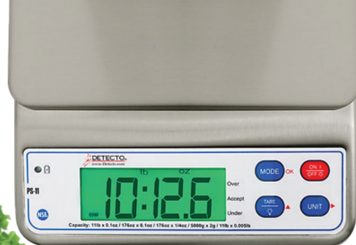
Bold, easy-to-read, 0.8-inch/20-mm high backlit LCD with checkweighing mode