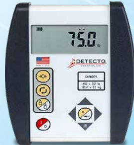
Model 750 indicator with easyto-use, basic weighing functions. BMI calculation, RS232 serial port, and big bold LCD digits.