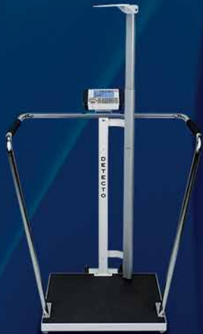
DETECTO Model 6857DHR