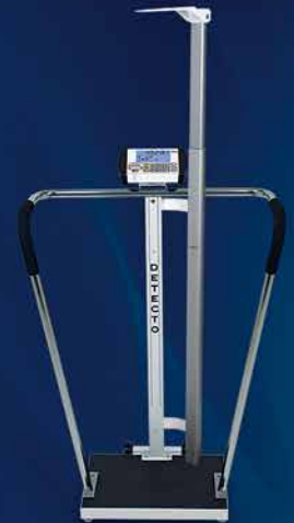
DETECTO Model 6854DHR

Detecto Scale reserves the right to improve, enhance, or modify features and specifications without prior notice.