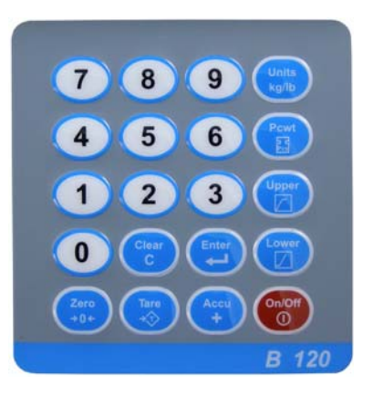
Figure 2: B 120 keypad

Each of the keys shown in Figure 2 is explained below.