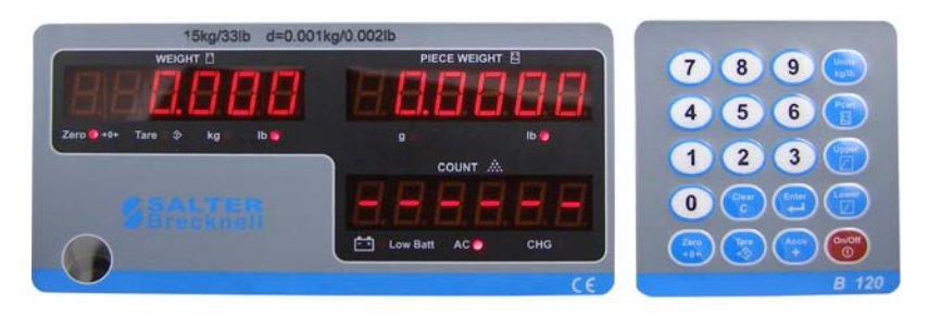
Figure 1: B120 front panel

The front panel, shown in Figure 1, consists of three display windows (WEIGHT, PIECE WEIGHT, and COUNT), the keypad, nine annunciators and the bubble level window.