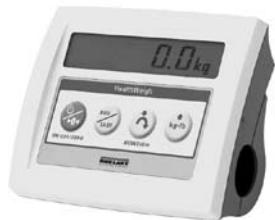
Bariatric/Handrail scale indicator