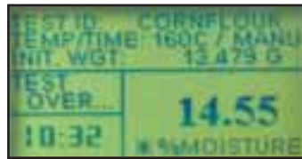
Display shows % moisture, % solids, weight, time, temperature, drying curve and more.