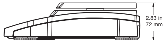
Models AV212N, AV412N, AV612N, AV812N, AV2101N, AV4101N, AV6101N AV8101N